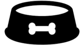
FOOD + WATER BOWLS