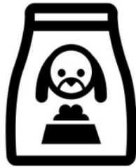
3 DAY SUPPLY OF PET FOOD