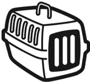
CARRY CAGE OR CRATE