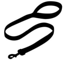
LEASH OR HARNESS