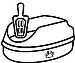
KITTY LITTER OR DOGGIE BAGS