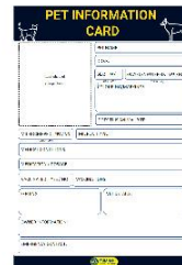
PET INFORMATION CARD