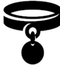
COLLAR AND ID TAG