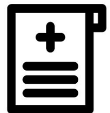
VACCINATION + MEDICAL RECORDS

KEEP EVERYTHING IN ONE PLACE SO YOU CAN EVACUATE QUICKLY IF NEEDED